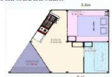
Plan SAHARI Junior