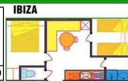
7,30x3,70 - 27 m 2